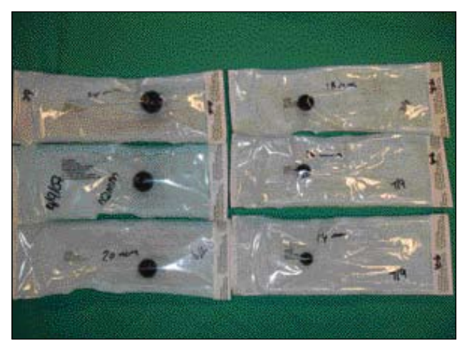
Figure 10: Silicone prostheses of various sizes, sterilized and ready for use.