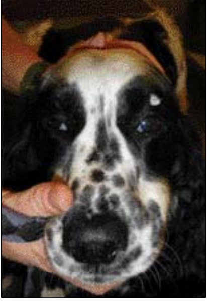
Figure 6: The left glaucomatous eye has been marked with Tippex pre-operatively to avoid any possible confusion.