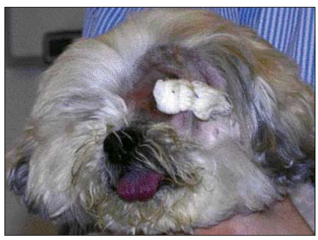
Figure 12: A stent was placed on the orbit to apply pressure to reduce post-operative bleeding.

Post-operative analgesia, in the form of non-steroidal antiinflammatory drugs, should be provided for approximately