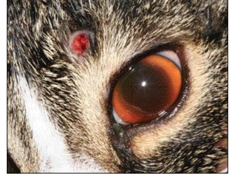
Figure 3: A painful, non-visual eye in a one-year-old domestic short-haired cat with scleral rupture due to a gun shot, with the entry wound visible above the eye.