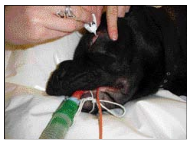
Figure 7: The endotracheal tube is secured around the lower jaw to keep it out of the way of surgery. Gel tears are placed on the eye before clipping to reduce the number

Choosing a technique for enucleation depends on the objectives to be achieved. Factors to take into account include the reason for enucleation and the cosmetic outcome desired. Owners may wish to discuss the benefits and disadvantages of various techniques before the operation, as discovering that an alternate technique could have been performed could lead to feelings of disappointment afterwards.