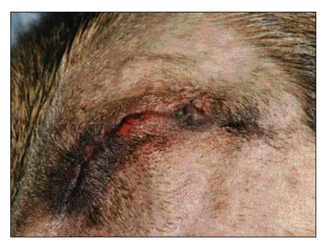
Figure 9: The intradermal skin layer results in no visible sutures at the end of the procedure.