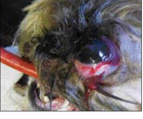
Figure 4: A twoyear-old Shih Tzu 20 minutes after traumatic proptosis of the left eye. The dog was 'scruffed' by another dog.