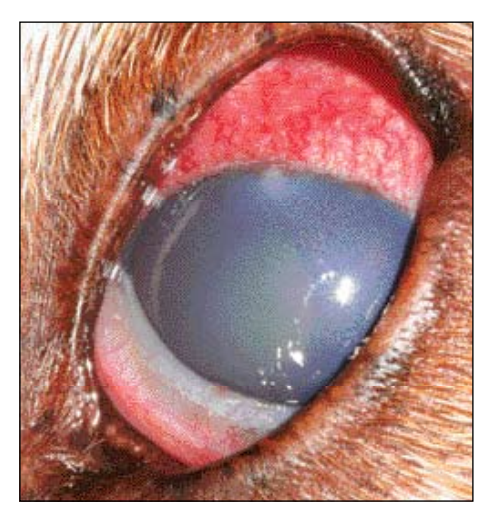
Figure 1: A 10-yearold Bassett hound with acute ocular pain, episcleral congestion, corneal oedema, fixed pupil and lack of visual responses due to acute glaucoma.