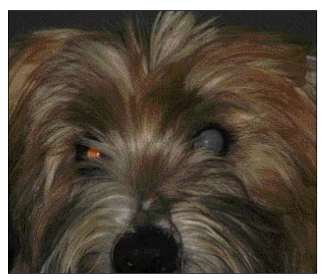
Figure 11: In this canine patient, the left eye had been eviscerated and a silicone prosthesis placed four years previously.

achieved as for the trans-conjunctival technique, although there is less tissue available for the deeper layer.