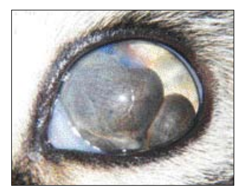
Figure 2: A smooth, dark mass is occupying most of the anterior chamber in the eye of this 12-year-old domestic short-haired cat with an intraocular sarcoma.