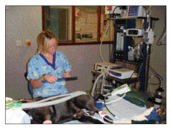
Figure 5: Remote monitoring of the patient is important as access to the head area will not be possible under drapes.

replacement), a capnograph, a rectal thermometer and a blood pressure monitor alongside palpation of the femoral pulse.