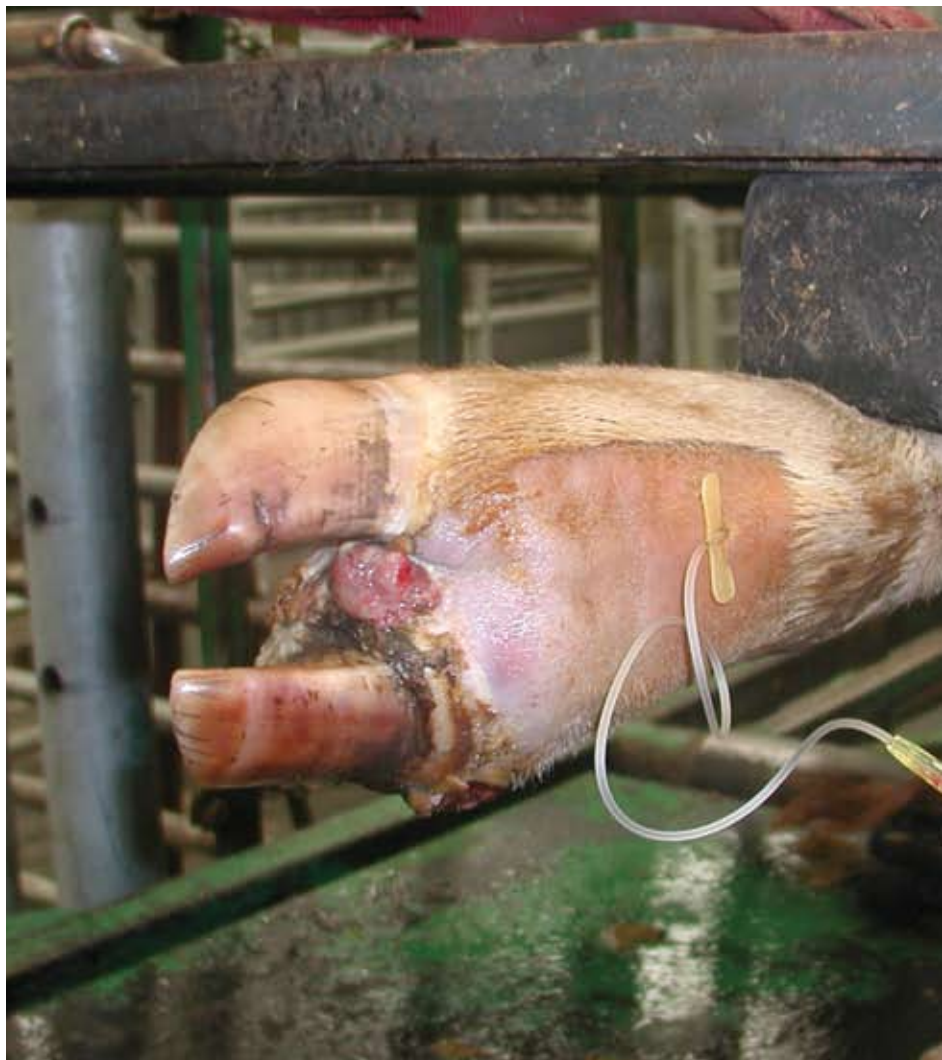
Regional intravenous analgesia using the dorsal pedal vein.

Pre-treatment in anticipation of a painful event provides more analgesia than treatment with the same drug and dosage after robust pain sensations develop, Walz says. "Unfortunately,