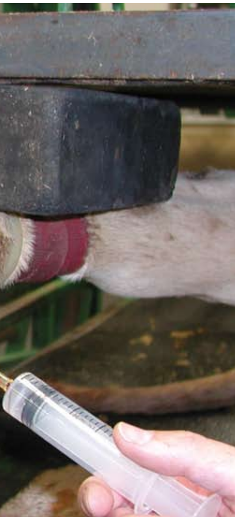
PAUL WALZ, DVM, PHD

phanol is used quite frequently and is considered an opioid agonist and antagonist because it has multiple opioid effects.