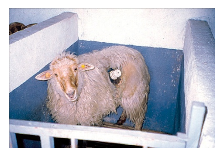
Figure 12: During all the animal observation period, the cannula surrounding area was kept shaved, clean and we used artrophod repellent products.

During all the animal observation period, the cannula surrounding area was kept shaved, clean and we used artrophod repellent products, (Deltametrine, Butox<sup>®</sup>) to avoid miasis (Figure 12).