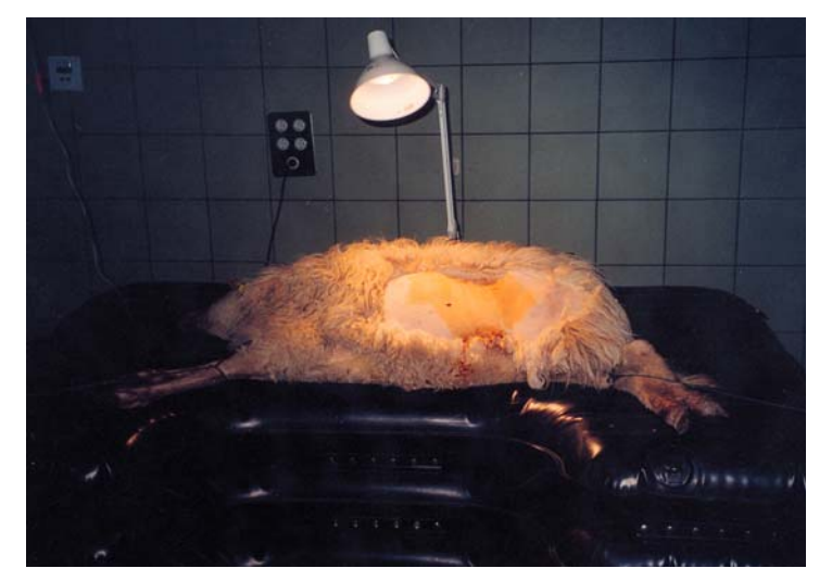
Figure 2: All the sheeps were placed in right lateral recumbency.

internal organs go to the more caudal abdominal portions releasing the pressure against the diaphragm.