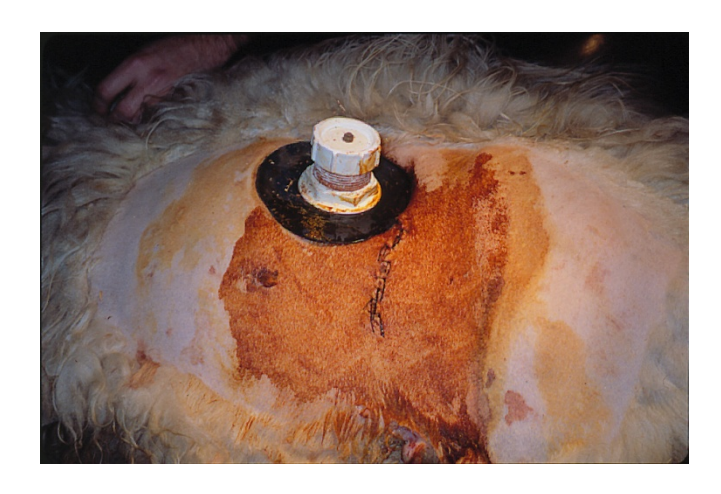
Figure 11: We finish closing the skin with simple suture points with monophilament material non absorb from 0 to 1, that will be removed after 7 to 10 days after surgery.

After anaesthesia recovery the animals were returned to the flock, to don't disturb the sheep herd instinct.