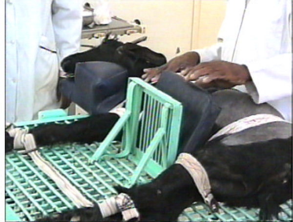
Animal was positioned on the table