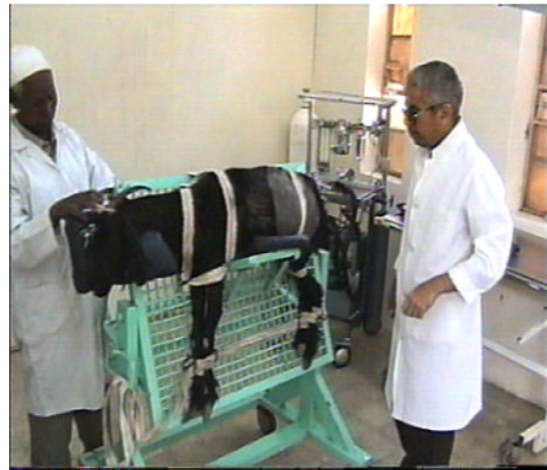
Table in perpendicular position

Caprine Rumenotomy Surgical Table: The table was designed by Professor Shnain (Fig 1a, b) and constructed in Khartoum North Industrial Area.