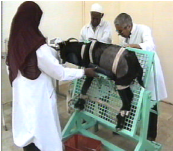
Fig. 1b: The new rumenotomy table for goats