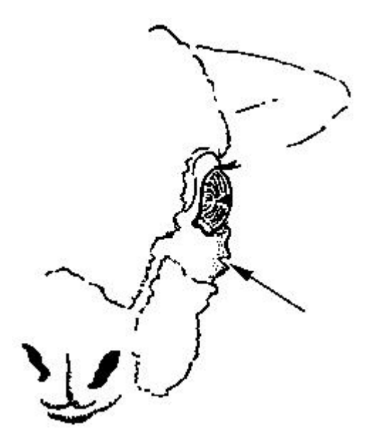
Figure 2: Side view of a surgically removed elliptical portion of the skin under the lower lid.

Figure 1: Front view of a surgically removed elliptical portion of the skin under the lower lid.