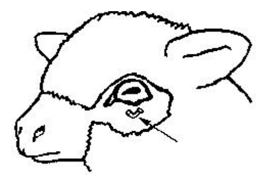
Figure 3: Stainless steel clip.