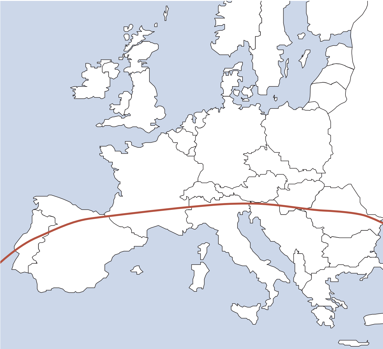
Figure 2a: Rhipicephalus sanguineus is primarily a tick of southern Europe: below the red line indicates where it occurs most frequently