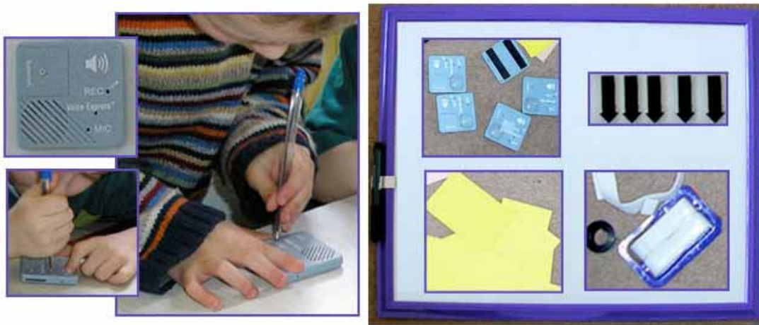
Figure 1. The Authoring Concept Mapping Kit