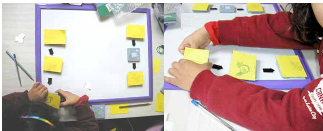
Figure 2. (a) Working on the conceptual relationship “the egg is in the stomach. (b) Working on the concept “egg”.

Nine children, from an Australian urban preschool, aged 4 to 5 were observed in their natural setting. While I worked with the whole class, 25 children in total, I am only permitted to report on 9 of these. The children interacted with the Kit during free-choice playtime for 6 sessions of 1½ hour each. The research was seeking to identify if (and to what extent) children could independently make knowledge explicit. The knowledge was to be made explicit using the Kit by labeling symbolic representations with the voice-recorders and showing reading direction with the arrows. Labeled symbols helped to distinguish concepts from propositions, identify abstract concepts, and what relationships were formed between concepts using linking phrases. All of these elements in sequence will allow the teacher or researcher to interpret the concept map.