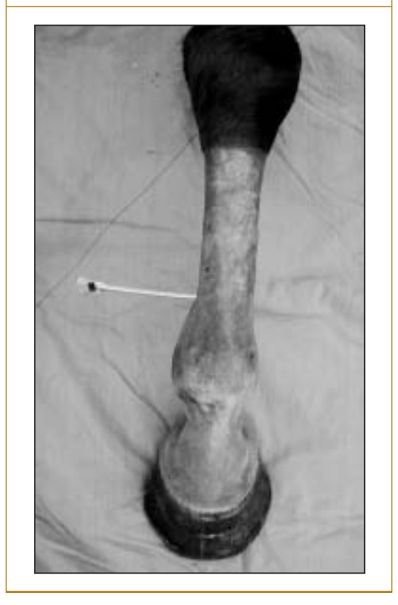
Figure 1: Location of intraosseous perfusion portal at junction of middle and distal one-third of cannon bone.

expedite the procedure. The tourniquet is removed 30 minutes following the initiation of perfusion. When performing repeated daily intraosseous perfusion, the skin incision is left open and the limb is bandaged between perfusion sessions. Each day following the initial perfusion session, the soft tissues are separated with hemostats to expose the cortical hole. The extension set is then wedged into the hole as previously described.