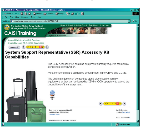
A sample from CAISI e-Learning program.

efficient and effective way to design, develop, and deliver tailorable training. An interdisciplinary design team at PNNL applied principles of cognitive psychology, human information processing, and learning to create the interactive, student-centered course. The training approach first conveys simpler concepts and then builds up to more complex problems. Frequent checks on learning, exercises, and optional quizzes reinforce the concepts using real-life examples and scenarios.