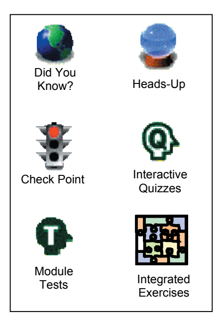
Interaction Elements used in CAISI e-Learning