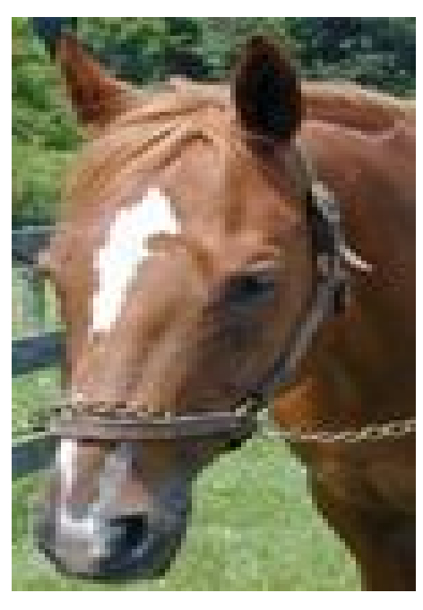
Placed over the nose bridge