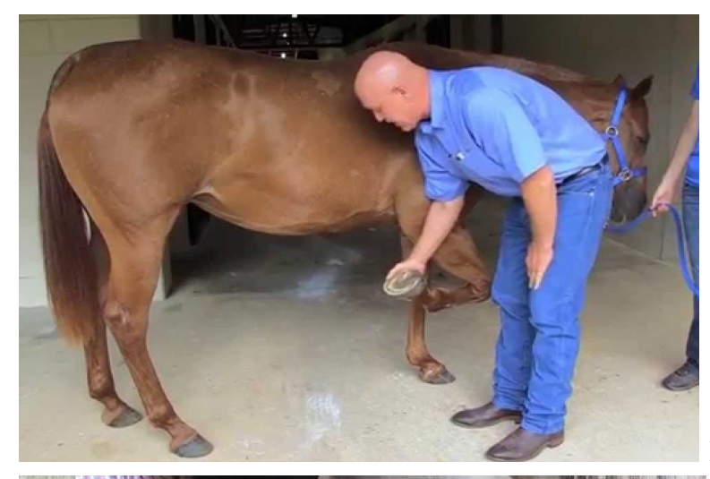
Lifting the forelimb