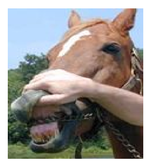
Placed through the mouth