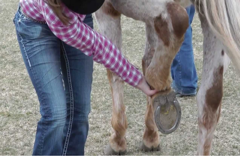
Lifting the hindlimb